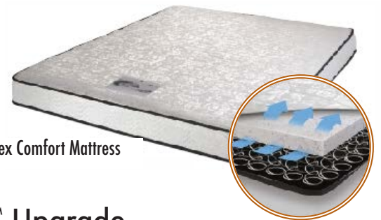
Flex Comfort Mattress