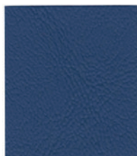
CY 21 Dk. Pewter