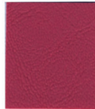
CY 28 Melon