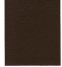
CY 13 Chaps