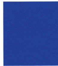
CY 26 Honesty