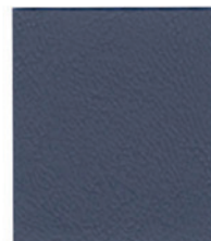
CY 06 Stone