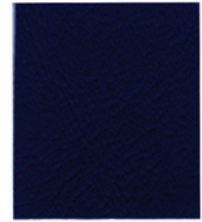
CY 17 Navy