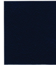
CY 16 Spruce