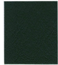
CY 30 Cyprus