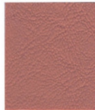
CY 34 Spice