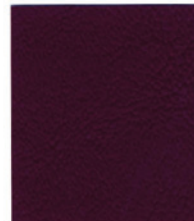
CY 03 Red