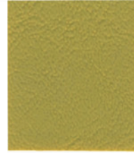
CY 07 Butter