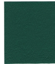
CY 35 Valley