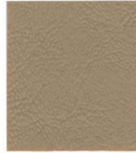
CY 02 Stardust