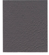
CY 04 Beach