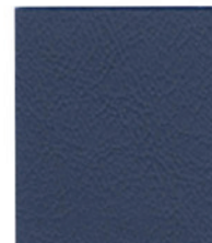
CY 19 Antelope