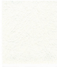
CY 20 Soft White