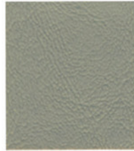
CY 05 Sunlight