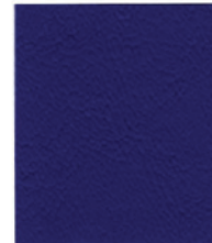
CY 33 Wood Violet