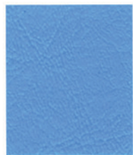
CY 29 Ocean