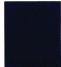
CY 18 Black