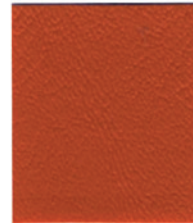
CY 27 Marmalade