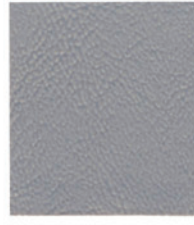
CY 15 Buff