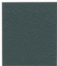
CY 11 Olive