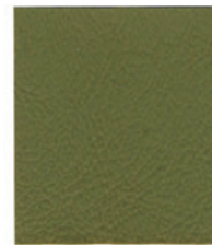
CY 24 Eden