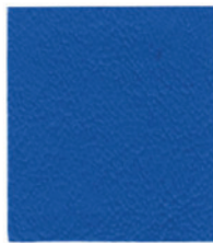
CY 32 Sea Glass