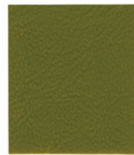
CY 23 Amber