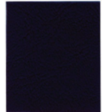
CY 14 Mahogany