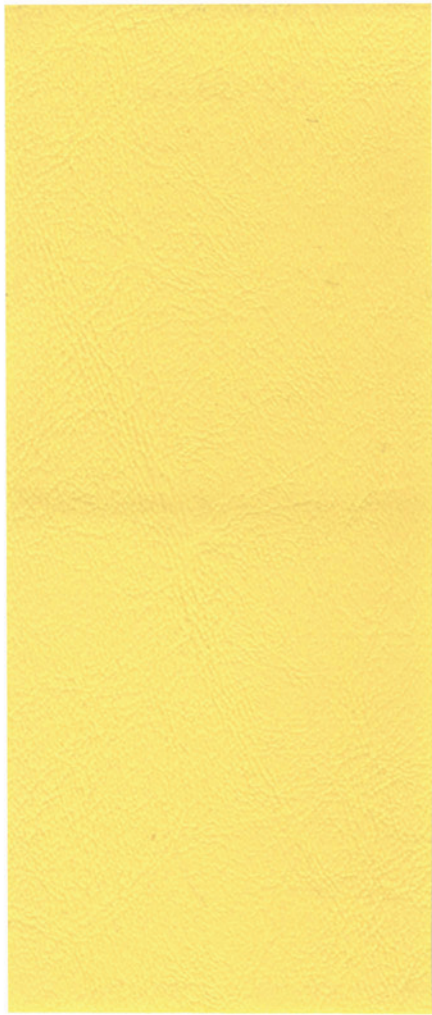
CY 25 First Light