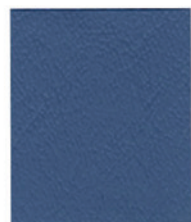
CY 22 Lt. Gray