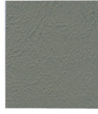
CY 12 Sand