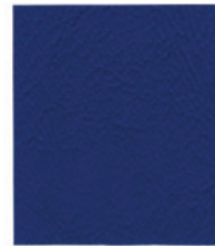
CY 09 Water